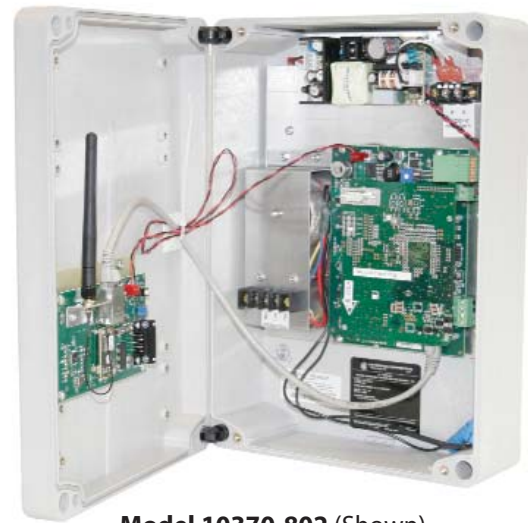
Model 10370-802 (Shown)